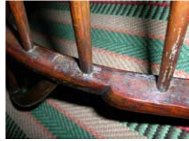
Fig. 26 Underside of arm showing mortise and tenon joint attaching bow to arm on Lemon Hill Henzey child's sack-back.