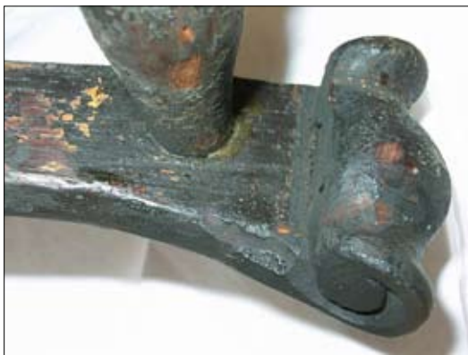
Fig. 8 Knuckle viewed from below shows the carved glue block.