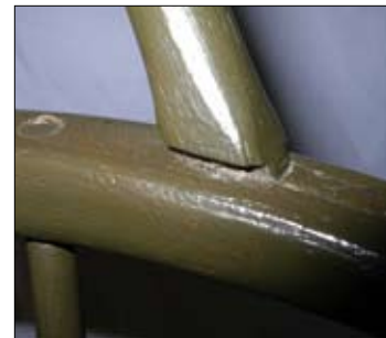
Fig. 16 Arm-bow joint, upper view. Museum catalog no. 7394.