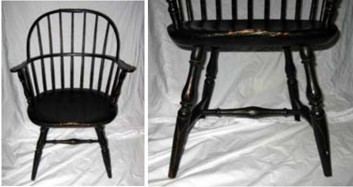
Figs. 2 & 3 Philadelphia sack-back that the author attributes to Francis Trumble, another Philadelphia master chair and cabinetmaker.

Figures 5–8 show the details of one of Henzey’s 1773 Carpenters’ Hall sack-backs. The wood he used for the bow, arm, knuckles and spindles on these chairs was hickory, a difficult wood to carve, but one that rewards the artist with very crisp, long-lasting details. Hickory does not hold paint well compared to other hardwoods, however. This is the reason why hickory parts typically appear unpainted at areas prone to high use.