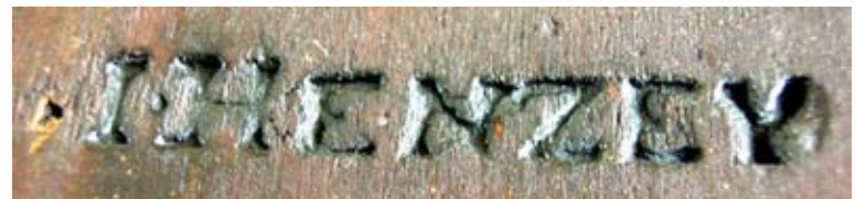
Fig. 22 Henzey brand on Lemon Hill child's sack-back.