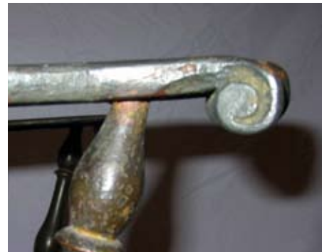
Fig. 6 Knuckle and arm post viewed from the outside.