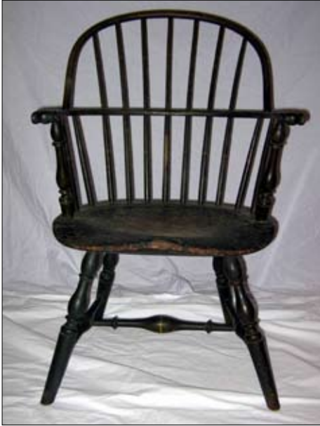
Fig. 9 Henzey Carpenters' Hall 1773 7-long spindle sack-back chair.