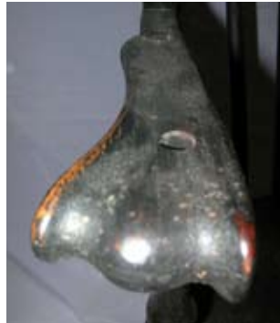
Fig. 7 Knuckle viewed from the front.