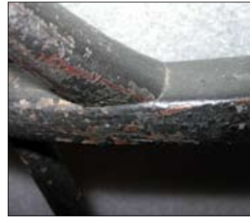
Fig. 15 Arm-bow joint, upper view.