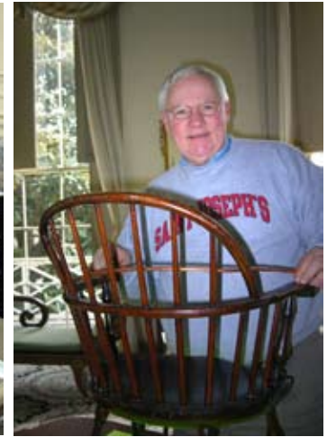
Figs. 20 & 21 A Henzey child's sack-back inspected by the author.