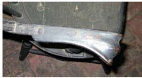
Fig. 5 Detail of the Henzey carved knuckle chair.