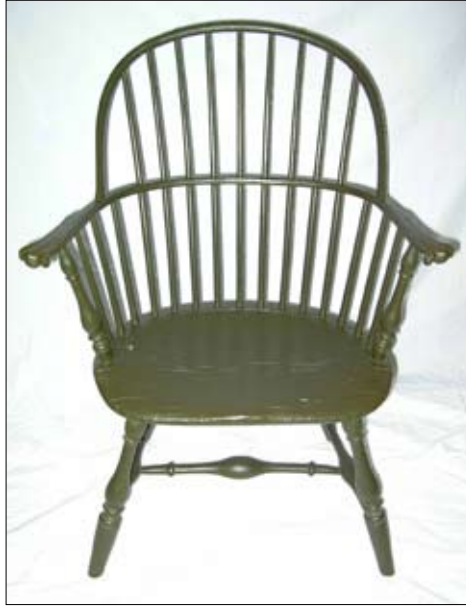
Fig. 10 Henzey 9-spindle chair from the Independence National Historical Park (INHP). Museum catalog number 8139.