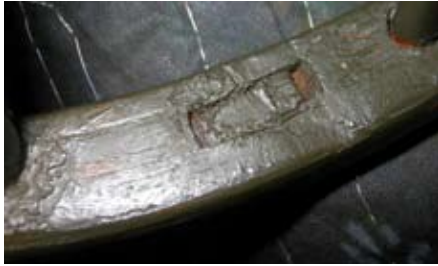
Fig. 18 Arm-bow mortise and tenon joint of an adult Henzey 9-spindle sack-back viewed from below. Catalog number 7394.